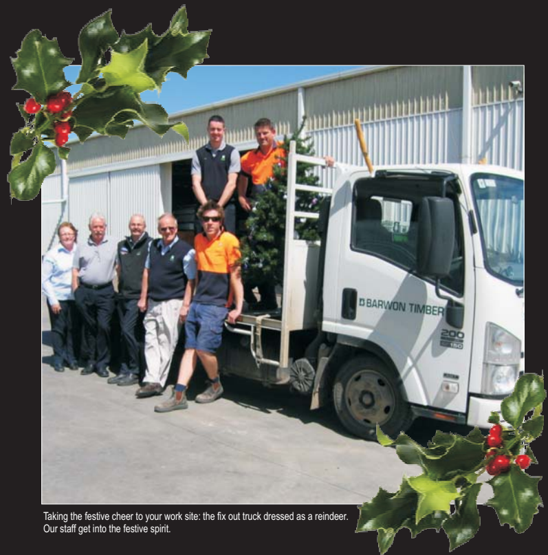
Taking the festive cheer to your work site: the fix out truck dressed as a reindeer. Our staff get into the festive spirit.

WE WISH YOU A SAFE AND HAPPY CHRISTMAS BREAK AND LOOK FORWARD TO WORKING WITH YOU IN THE NEW YEAR.