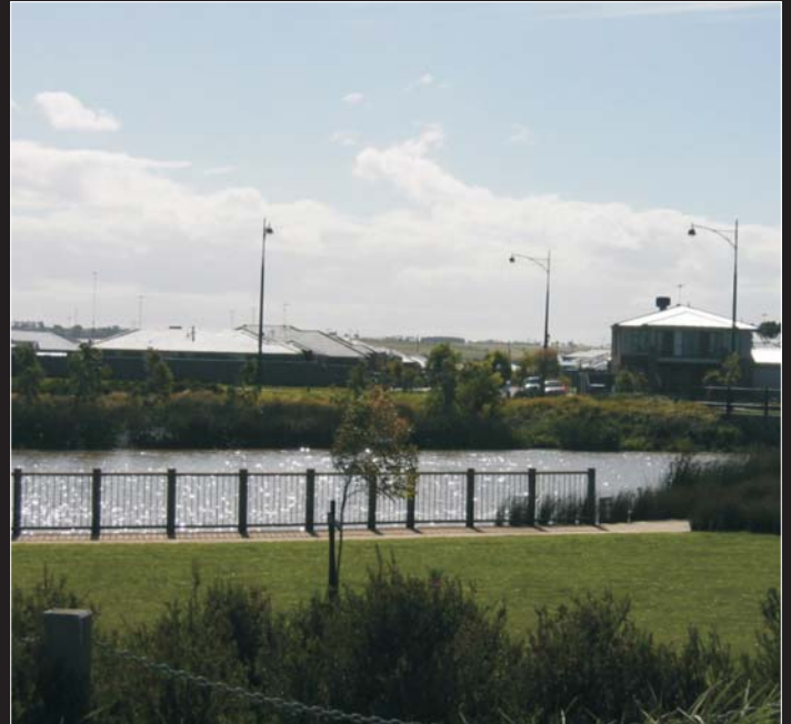
The wetland system, boardwalk and parks at Grand Lakes Estate, Lara developed by L. Bisinella developments. Boardwalk construction by Trak Constructions.

If you are involved in a project that requires large volumes of timber or specialty timbers please contact our team in the timber office or one of our account managers. We are happy to source what you are looking for.