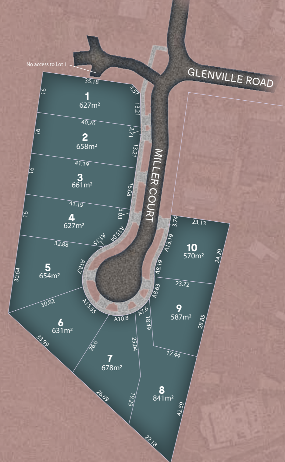
Proposed Lot Sizes