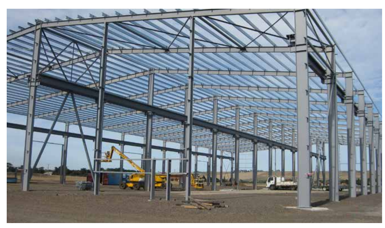
RPC Technologies under construction

A Body Corporate will be responsible for regularly maintaining the trees and nature strips along Bacchus Marsh Road, Heales Road, McManus Road and Technology Close.