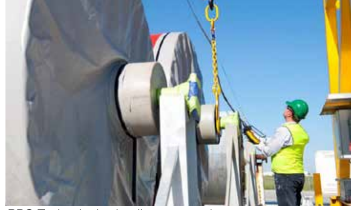
RPC Technologies loading new equipment